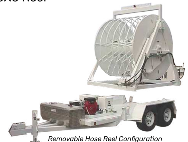
Removable Hose Reel Configuration

*Call us at (952) 467-3100 or email us at sales@hydro-eng.com for more configuration options